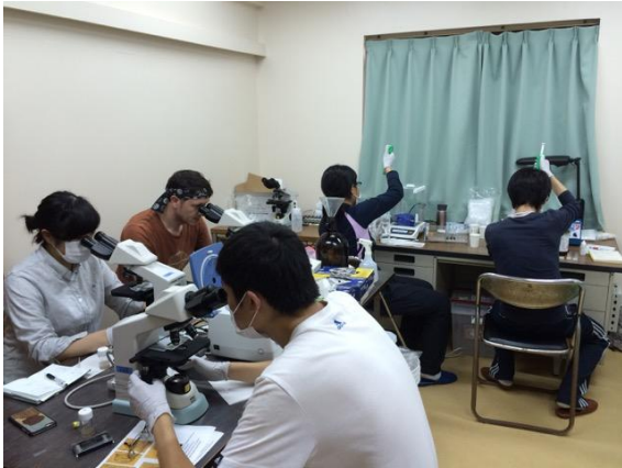
Working in the lab

Thanks to this course, I have the chance to get more close to Japanese macaques, and collect samples. It really helps a lot for my future works.