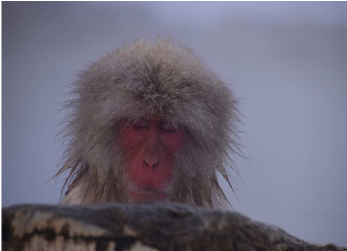
Monkeys look very relaxed Some monkeys were grooming in the hot spring

We observed Japanese macaques for three hours on each day. I was very satisfied to observe maybe most famous Japanese monkeys around the world!