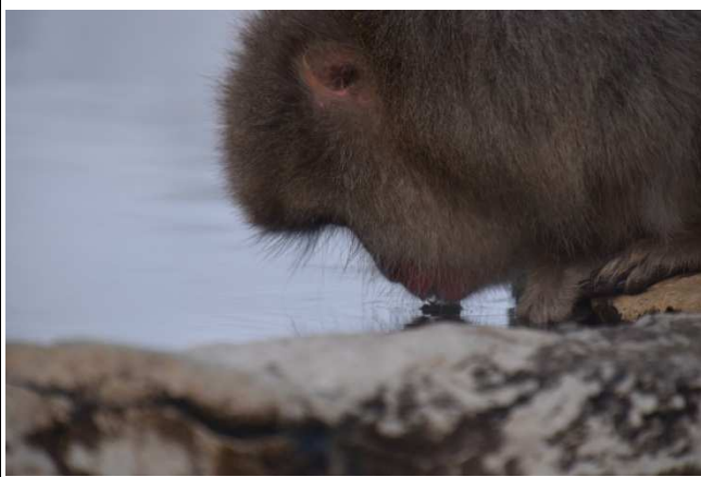
A monkey drinking hot spring