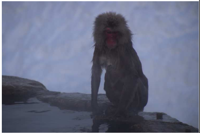
They looked cold after taking a bath