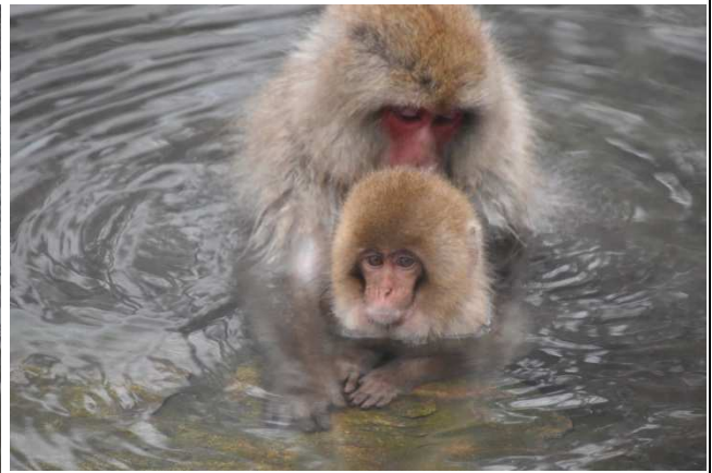
A mother and an infant taking a bath