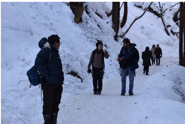
Up : walking on the snow Left: a monkey eating buds Right: a monkey eating bark