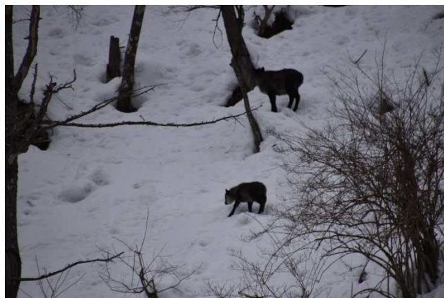
Japanese serows (a mother and the calf)