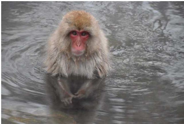
Basic posture during taking a bath