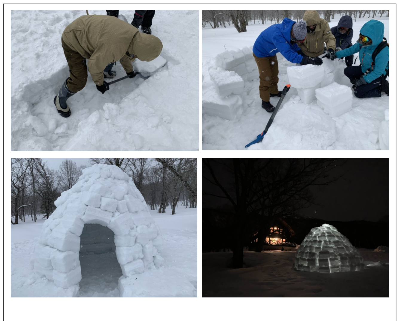
Building the igloo nearby the Kyoto University Sasagamine Hütte