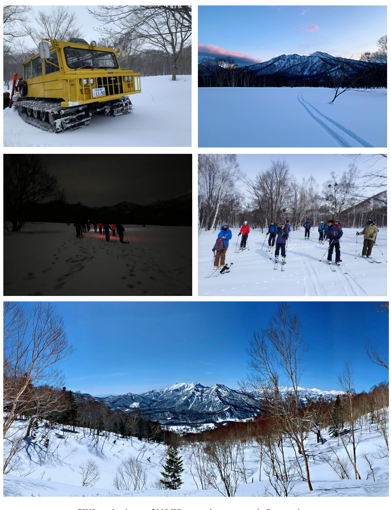
PWS academic year 2019 Winter student program in Sasagamine