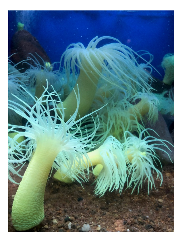
Sea anemone at Kyoto University Shirahama Aquarium

(Please be sure to submit this report after the trip that supported by PWS.)