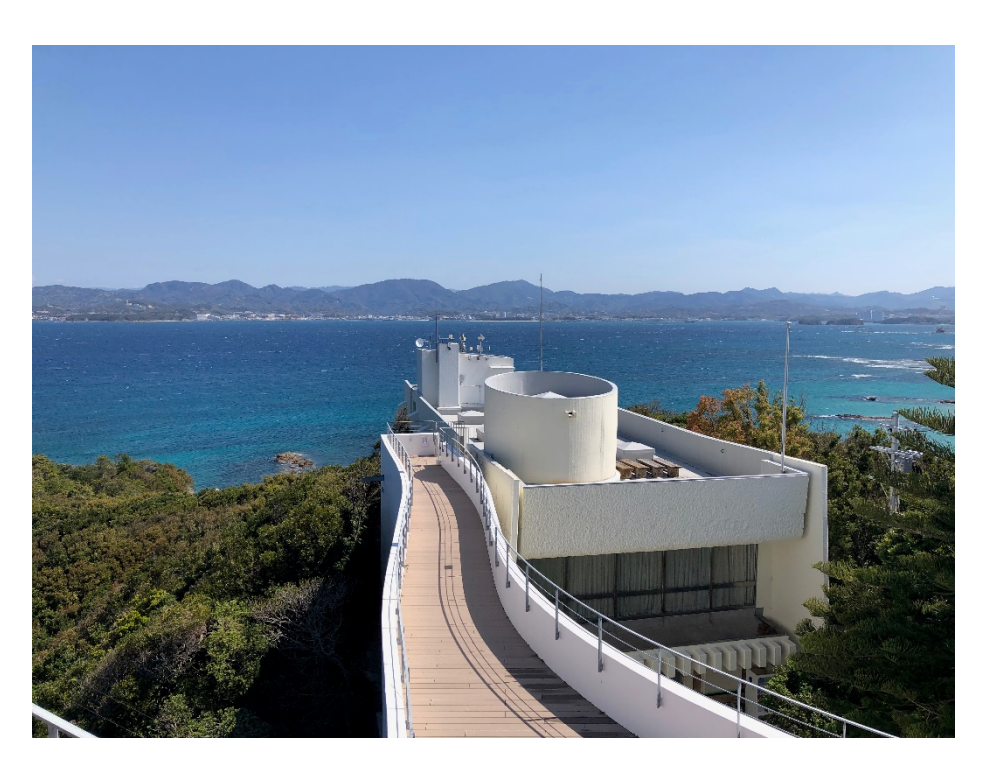
Observation deck at the Minakata Kumagusu Museum, Shirahama