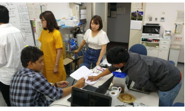
Fig. 2 Group's discussion in analysing microsatellite genotyping data