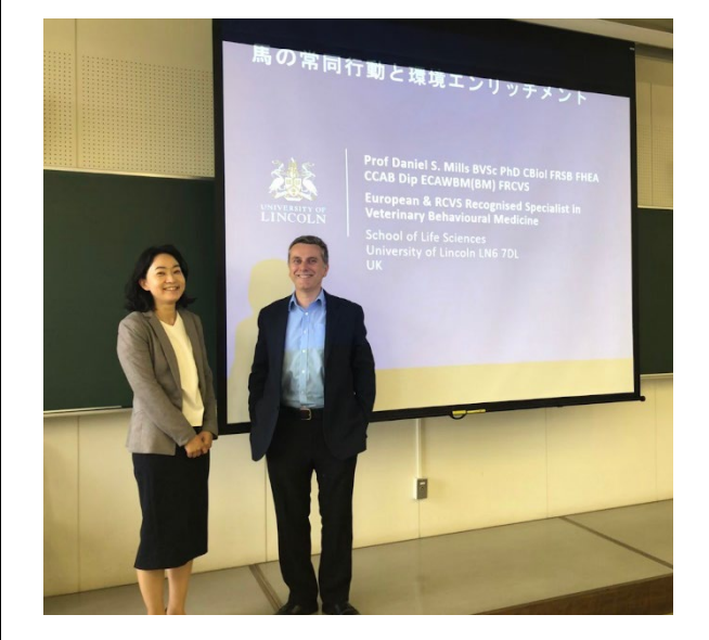
Lecture on Animal Behavior at Rakuno Gakuen University