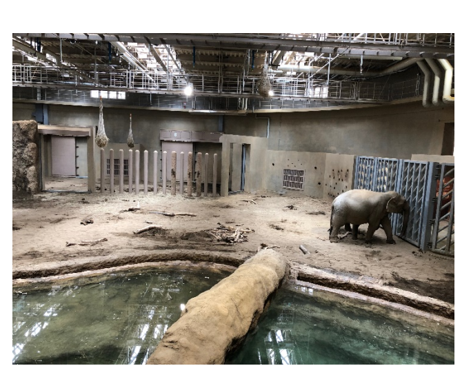
Elephant enclosure at Maruyama Park, Hokkaido