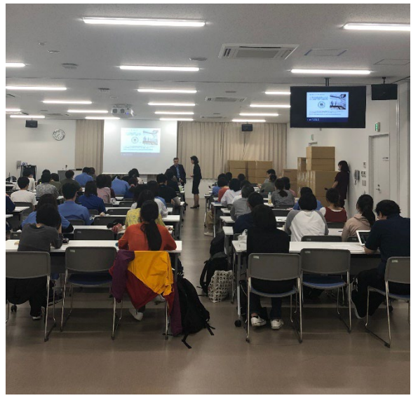
Lecture on Animal Behavior at Rakuno Gakuen University