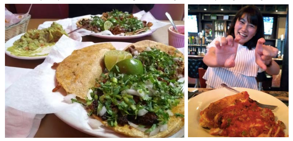
Loads of good food in Chicago (Mexican tacos, guacamole and homemade chips and deep dish pizza!!).

Submit to: report@wildlife-science.org 2014.05.27 version