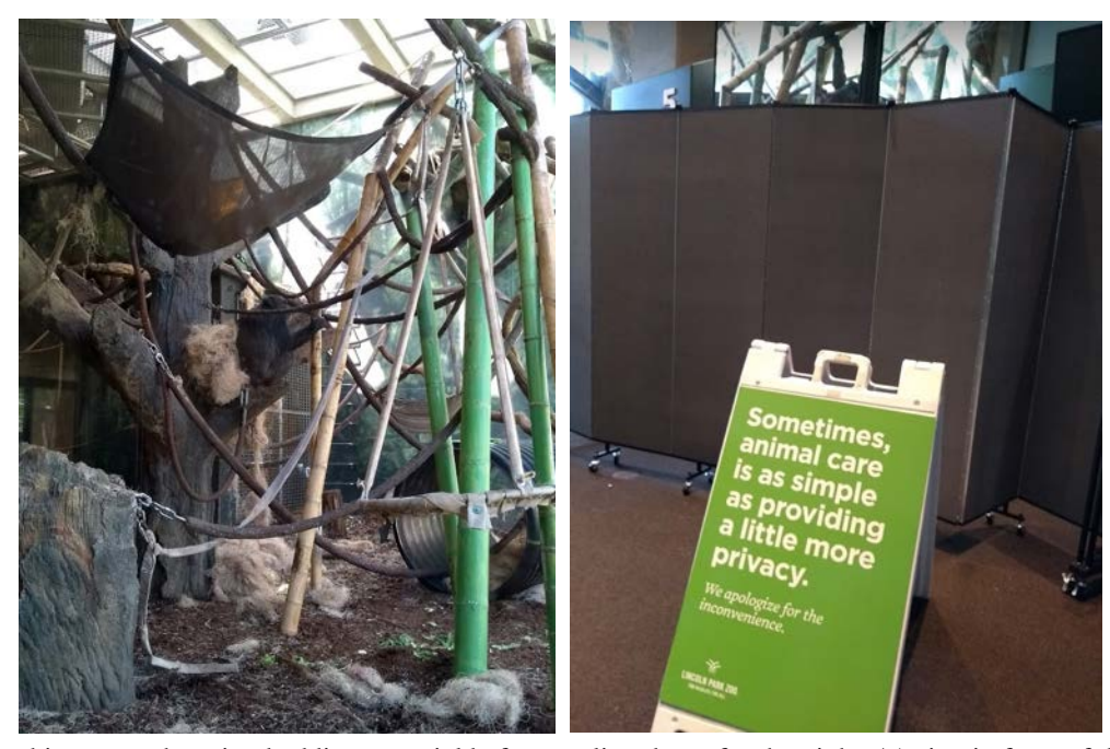
A female chimpanzee hogging bedding material before settling down for the night. / A sign in front of the gorilla enclosure.