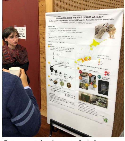
Poster presentation about pet cafes in Japan and the implication in conservation and