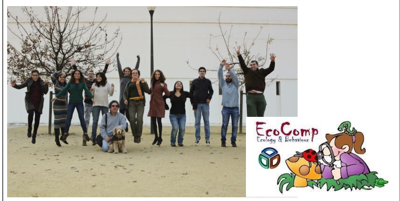
Fig. 1. Ecocomp group (members and logo), image retrieved in Informative Report Card of the Portuguese Ethology Society, volume 2, no.3 (2014).

In sum, this trip helped me to refine some of my analysis and presentation efforts. It also solidified international collaborations.